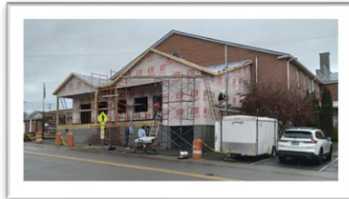
Front Expansion Construction 12.9.24

Keep an eye on the front – it'll be finished before we know it!